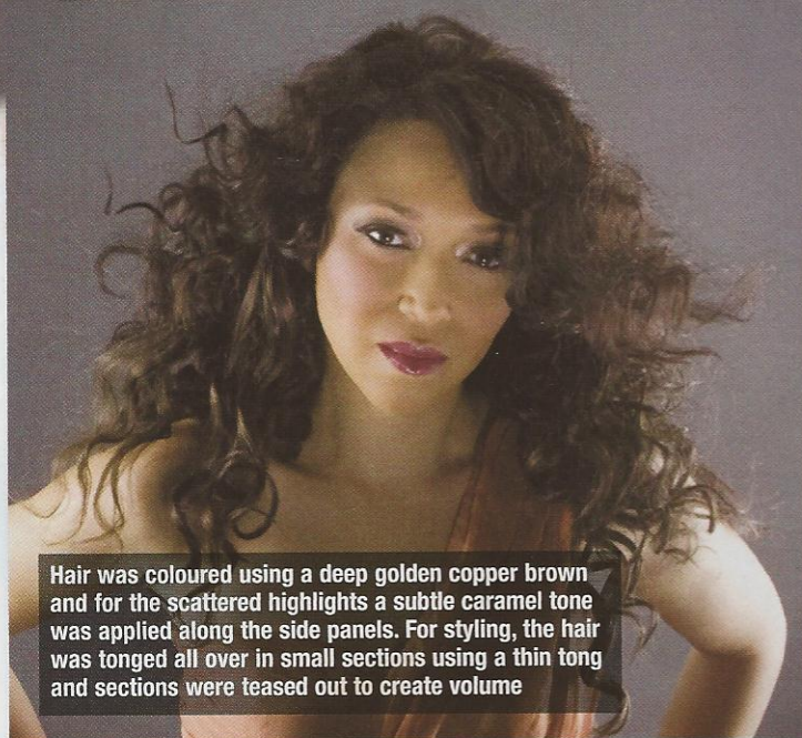
Hair was coloured using a deep golden copper brown and for the scattered highlights a subtle caramel tone was applied along the side panels. For styling, the hair was tonged all over in small sections using a thin tong and sections were teased out to create volume