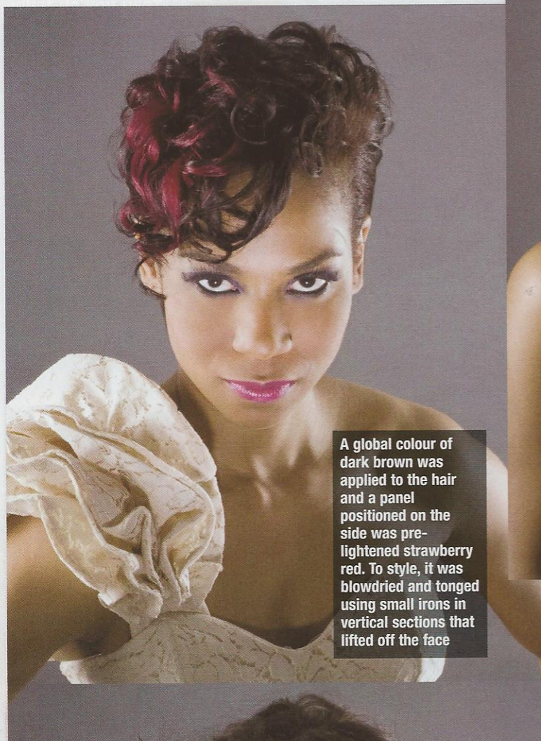
A global colour of dark brown was applied to the hair and a panel positioned on the side was pre-lightened strawberry red. To style, it was blowdried and tonged using small irons in vertical sections that lifted off the face